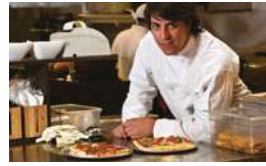
5 Luigi is a _____ in an Italian restaurant.